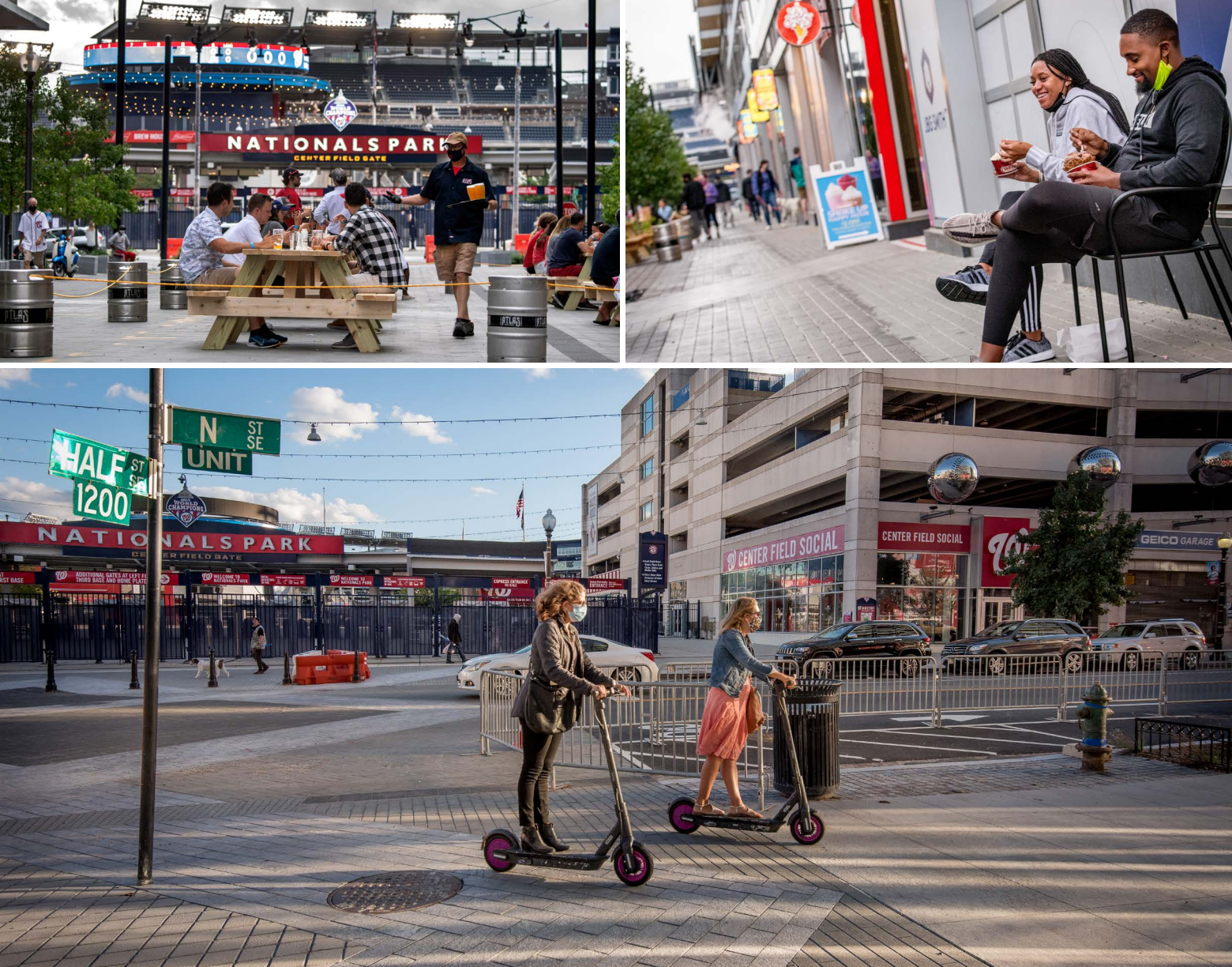
RIGHT PAGE FROM TOP. Nationals Park. Half Street. Wood-roasted oysters.